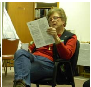
Holiday Open House December 4