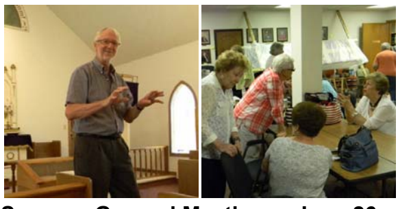
Summer General Meeting June 26