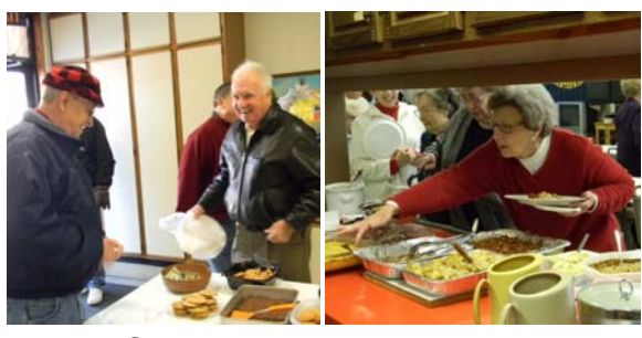
Winter General Meeting January 10