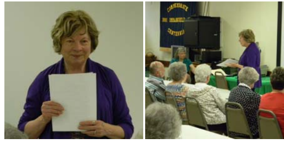
Spring General Meeting April 24