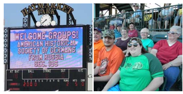
Lincoln Saltdogs Baseball June 18