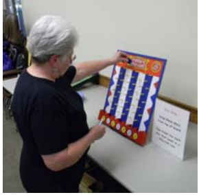
Fall General Meeting & Picnic October 9