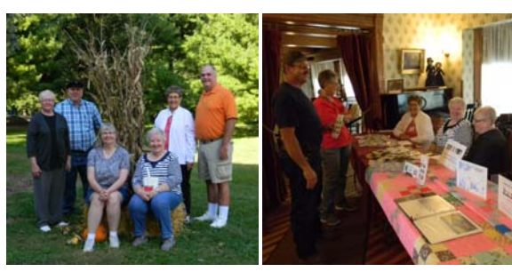
Arbor Lodge Ethnic Festival October 2